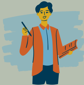
Educational Services 6,900 Jobs +700 compared to 2020