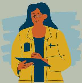
Health Care & Social Assistance 10,400 Jobs +2300 compared to 2020