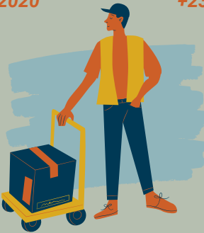
Manufacturing 6,400 Jobs -200 compared to 2020