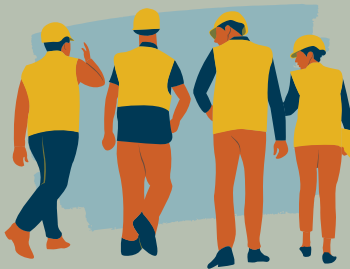
Construction 5,200 Jobs -900 compared to 2020