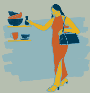
Wholesale & Retail Trade 12,900 Jobs -200 compared to 2020

The Lethbridge workforce is very diverse and has seen a shift over the past 3 years. Some of these changes are due to changing demands in tools and skills, consumer habits and a hangover from pandemic related effects on the workforce. Included here is the number of jobs in each sector in February 2023 and also a historical benchmark compared to the same time in 2020.